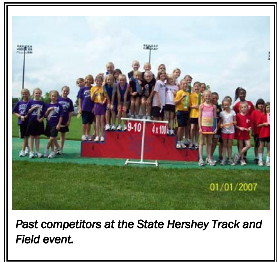
Past competitors at the State Hershey Track and Field event.