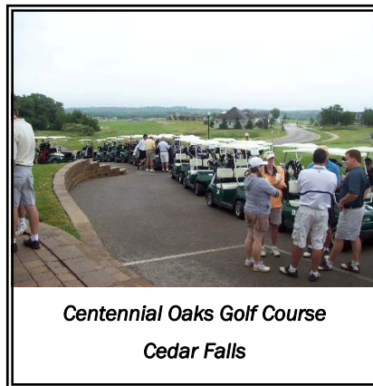
Centennial Oaks Golf Course Cedar Falls

Marks Park. This breathtaking area will be the home to numerous social and cultural events for years to come. Just a short walk away from the river, we will come across the Public Market. This unique public-private partnership houses our very first year-round food Co-Op. West of the Public Market, we hope to see the beginning of the state-of-the-art, 130,000 square-foot Cedar Valley SportsPlex. East of the Market is the Expo Plaza, another home to numerous social and entertainment events in the downtown area. As you can tell, we plan to have a bus driver that is not afraid to speed through the Cedar Valley a bit. We plan to make every moment of the tour count. We hope you plan to come along for the ride!