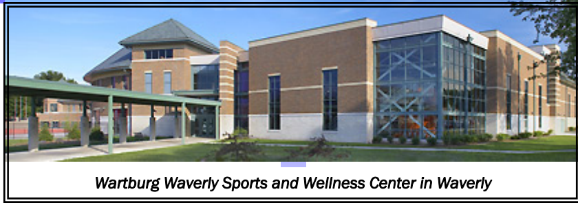
Wartburg Waverly Sports and Wellness Center in Waverly

As we steer the bus to downtown, we will have the opportunity to visit the 3,000 seat Young Arena—home of the Waterloo Black Hawks. Built in 1994, Young Arena is a magnet for sports tourists throughout the year. Just across Highway 63, we will find the Phelps Youth Pavilion. This interactive addition to the Waterloo Center for the Arts is always a popular spot for children and their parents to visit. On the riverside, behind the Phelps Youth Pavilion, tourists will be able to view the central pieces of the Riverfront Renaissance project—the Upper and Lower Plaza, Performance Structure and