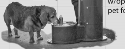
440 SM w/optional pet fountain